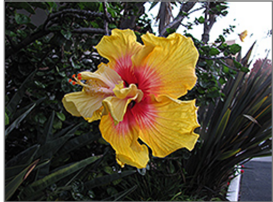
The Path Hibiscus flowers