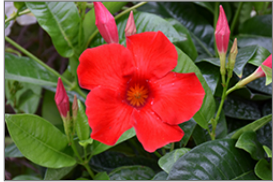
Red Mandevilla flowers

When grown indoors, Red Mandevilla can be expected to grow to be about 10 feet tall at maturity, with a spread of 24 inches. It grows at a medium rate, and under ideal conditions can be expected to live for approximately 20 years. This houseplant will do well in a location that gets either direct or indirect sunlight, although it will usually require a more brightly-lit environment than what artificial indoor lighting alone can provide. It requires an evenly moist well-drained soil for optimal growth. The surface of the soil shouldn't be allowed to dry out completely, and so you should expect to water this plant once and possibly even twice each week. Be aware that your particular watering schedule may vary depending on its location in the room, the pot size, plant size and other conditions; if in doubt, ask one of our experts in the store for advice. It is not particular as to soil type or pH; an average potting soil should work just fine. Be warned that parts of this plant are known to be toxic to humans and animals, so special care should be exercised if growing it around children and pets.