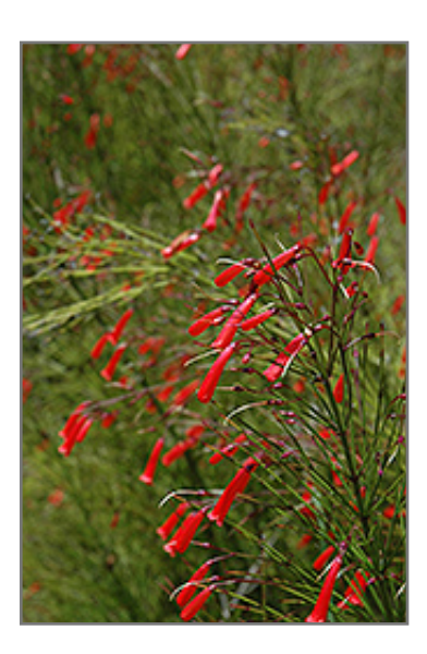
Firecracker Plant flowers

When grown indoors, Firecracker Plant can be expected to grow to be about 3 feet tall at maturity, with a spread of 4 feet. It grows at a fast rate, and under ideal conditions can be expected to live for approximately 10 years. This houseplant will do well in a location that gets either direct or indirect sunlight, although it will usually require a more brightly-lit environment than what artificial indoor lighting alone can provide. It does best in average to evenly moist soil, but will not tolerate standing water. The surface of the soil shouldn't be allowed to dry out completely, and so you should expect to water this plant once and possibly even twice each week. Be aware that your particular watering schedule may vary depending on its location in the room, the pot size, plant size and other conditions; if in doubt, ask one of our experts in the store for advice. It is not particular as to soil type or pH; an average potting soil should work just fine.