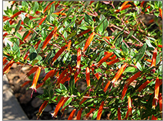
Firecracker Plant flowers

Other Names: Mexican Cigar Plant, Cigar Flower