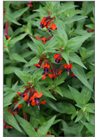
Ilavea Cuphea flowers

There are many factors that will affect the ultimate height, spread and overall performance of a plant when grown indoors; among them, the size of the pot it's growing in, the amount of light it receives, watering frequency, the pruning regimen and repotting schedule. Use the information described here as a guideline only; individual performance can and will vary. Please contact the store to speak with one of our experts if you are interested in further details concerning recommendations on pot size, watering, pruning, repotting, etc.