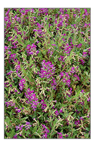
Sriracha Violet Cuphea flowers

When grown indoors, Sriracha Violet Cuphea can be expected to grow to be about 24 inches tall at maturity, with a spread of 24 inches. It grows at a medium rate, and under ideal conditions can be expected to live for approximately 10 years. This houseplant will do well in a location that gets either direct or indirect sunlight, although it will usually require a more brightly-lit environment than what artificial indoor lighting alone can provide. It does best in average to evenly moist soil, but will not tolerate standing water. The surface of the soil shouldn't be allowed to dry out completely, and so you should expect to water this plant once and possibly even twice each week. Be aware that your particular watering schedule may vary depending on its location in the room, the pot size, plant size and other conditions; if in doubt, ask one of our experts in the store for advice. It is not particular as to soil pH, but grows best in rich soil. Contact the store for specific recommendations on pre-mixed potting soil for this plant.