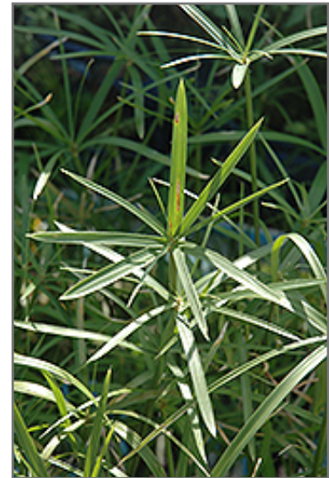
Miniature Umbrella Plant foliage

There are many factors that will affect the ultimate height, spread and overall performance of a plant when grown indoors; among them, the size of the pot it's growing in, the amount of light it receives, watering frequency, the pruning regimen and repotting schedule. Use the information described here as a guideline only; individual performance can and will vary. Please contact the store to speak with one of our experts if you are interested in further details concerning recommendations on pot size, watering, pruning, repotting, etc.