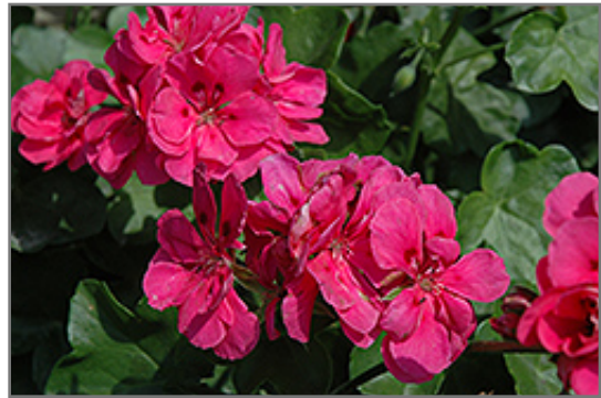
Great Balls of Fire Pink Ivy Leaf Geranium flowers