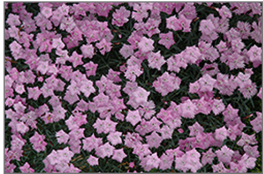
Bath's Pink Pinks in bloom

Bath's Pink Pinks is recommended for the following landscape applications;