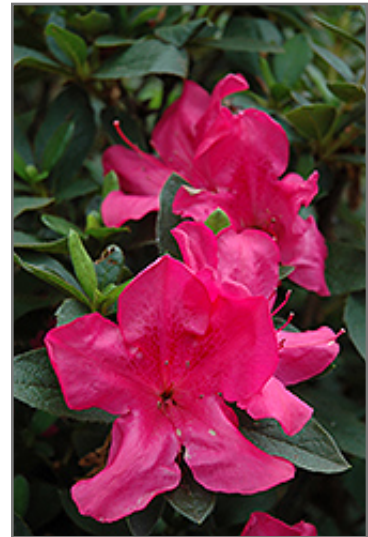
Encore Autumn Sangria Azalea flowers

When grown indoors, Encore Autumn Sangria Azalea can be expected to grow to be about 3 feet tall at maturity, with a spread of 3 feet. It grows at a slow rate, and under ideal conditions can be expected to live for approximately 40 years. This houseplant will do well in a location that gets either direct or indirect sunlight, although it will usually require a more brightly-lit environment than what artificial indoor lighting alone can provide. It requires an evenly moist well-drained soil for optimal growth, but will suffer if left to grow in standing water. The surface of the soil shouldn't be allowed to dry out completely, and so you should expect to water this plant once and possibly even twice each week. Be aware that your particular watering schedule may vary depending on its location in the room, the pot size, plant size and other conditions; if in doubt, ask one of our experts in the store for advice. It is very fussy about its soil conditions and must be grown in rich, acidic soil to ensure success. Contact the store for specific recommendations on pre-mixed potting soil for this plant.