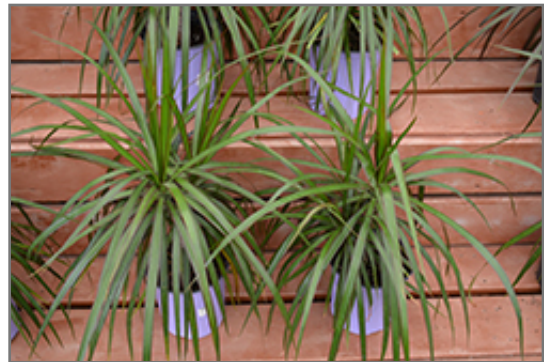
Red-edge Dracaena

Bandera Location 8516 Bandera Road San Antonio, TX 78250 (210) 680-2394