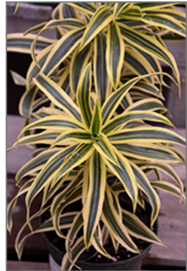
Song of India Plant in full

There are many factors that will affect the ultimate height, spread and overall performance of a plant when grown indoors; among them, the size of the pot it's growing in, the amount of light it receives, watering frequency, the pruning regimen and repotting schedule. Use the information described here as a guideline only; individual performance can and will vary. Please contact the store to speak with one of our experts if you are interested in further details concerning recommendations on pot size, watering, pruning, repotting, etc.