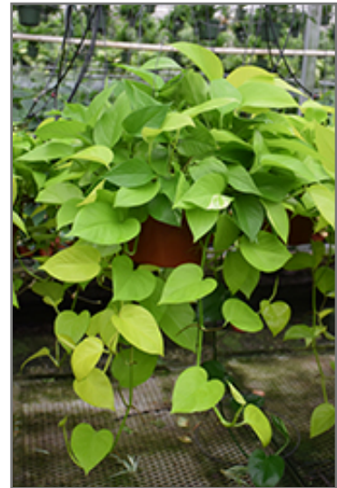
Neon Pothos in full

When grown indoors, Neon Pothos can be expected to grow to be about 5 feet tall at maturity, with a spread of 24 inches. It grows at a fast rate, and under ideal conditions can be expected to live for approximately 10 years. This houseplant performs well in both bright or indirect sunlight and strong artificial light, and can therefore be situated in almost any well-lit room or location. It does best in average to evenly moist soil, but will not tolerate standing water. The surface of the soil shouldn't be allowed to dry out completely, and so you should expect to water this plant once and possibly even twice each week. Be aware that your particular watering schedule may vary depending on its location in the room, the pot size, plant size and other conditions; if in doubt, ask one of our experts in the store for advice. It is not particular as to soil type or pH; an average potting soil should work just fine. Be warned that parts of this plant are known to be toxic to humans and animals, so special care should be exercised if growing it around children and pets.