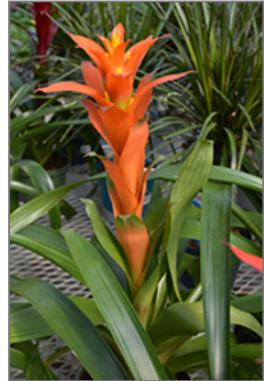
Torch Guzmania Bromeliad flowers

There are many factors that will affect the ultimate height, spread and overall performance of a plant when grown indoors; among them, the size of the pot it's growing in, the amount of light it receives, watering frequency, the pruning regimen and repotting schedule. Use the information described here as a guideline only; individual performance can and will vary. Please contact the store to speak with one of our experts if you are interested in further details concerning recommendations on pot size, watering, pruning, repotting, etc.