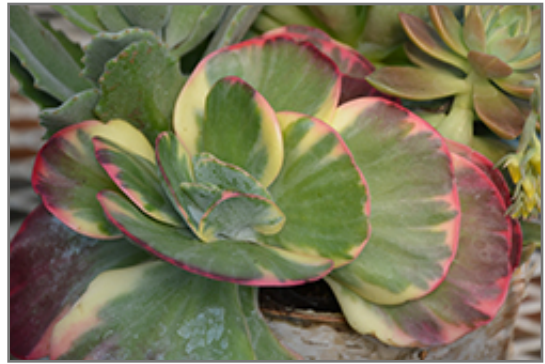
Fantastic Variegated Paddle Plant foliage