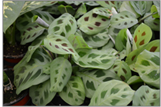
Prayer Plant foliage

A stunning plant producing leaves with striking color patterns; an excellent indoor accent plant; leaves close upward at night resembling praying hands; flowers rarely appear on houseplant specimens