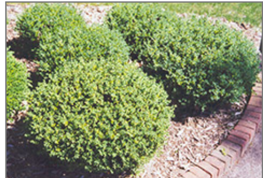
Japanese Boxwood