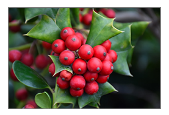
Dazzler Chinese Holly fruit

Dazzler Chinese Holly is recommended for the following landscape applications;