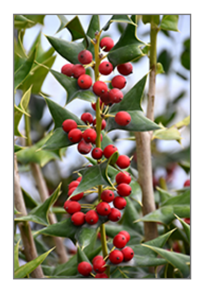
Dazzler Chinese Holly fruit

Bandera Location 8516 Bandera Road San Antonio, TX 78250 (210) 680-2394