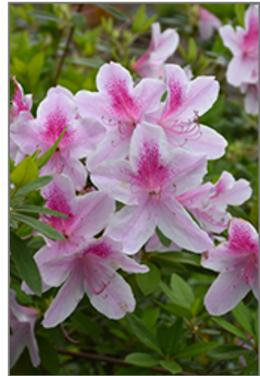
George Lindley Taber Azalea flowers