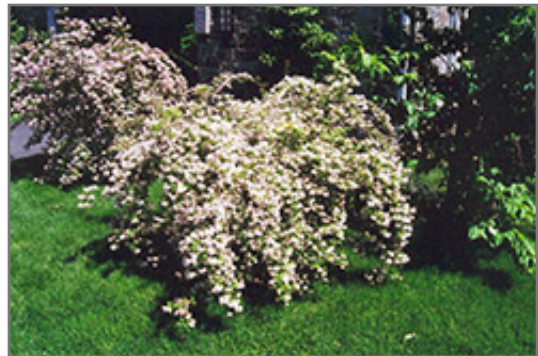
Beautybush in bloom