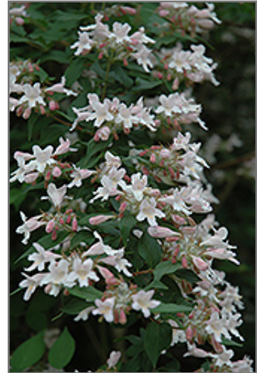
Beautybush flowers