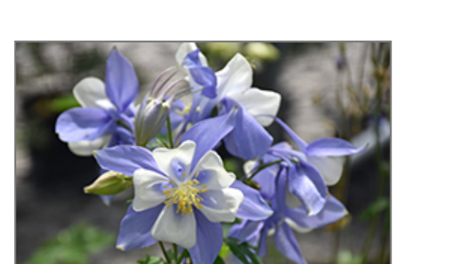
Songbird Blue Bird Columbine flowers