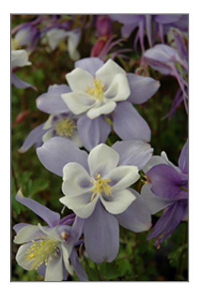
Songbird Blue Bird Columbine flowers

Bandera Location 8516 Bandera Road San Antonio, TX 78250 (210) 680-2394