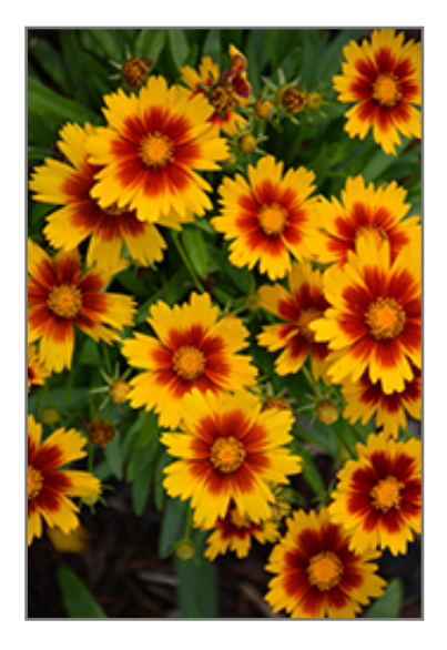
UpTick Gold and Bronze Tickseed flowers

Bandera Location 8516 Bandera Road San Antonio, TX 78250 (210) 680-2394