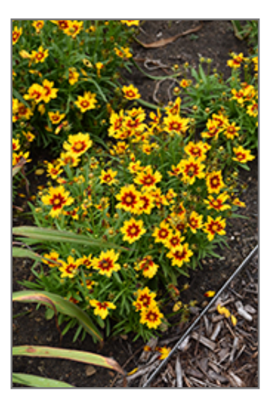
UpTick Gold and Bronze Tickseed in bloom

UpTick Gold and Bronze Tickseed is a fine choice for the garden, but it is also a good selection for planting in outdoor pots and containers. It is often used as a 'filler' in the 'spiller-thriller-filler' container combination, providing a mass of flowers against which the thriller plants stand out. Note that when growing plants in outdoor containers and baskets, they may require more frequent waterings than they would in the yard or garden.