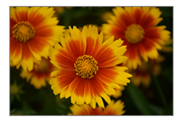
UpTick Gold and Bronze Tickseed flowers

UpTick Gold and Bronze Tickseed is recommended for the following landscape applications;