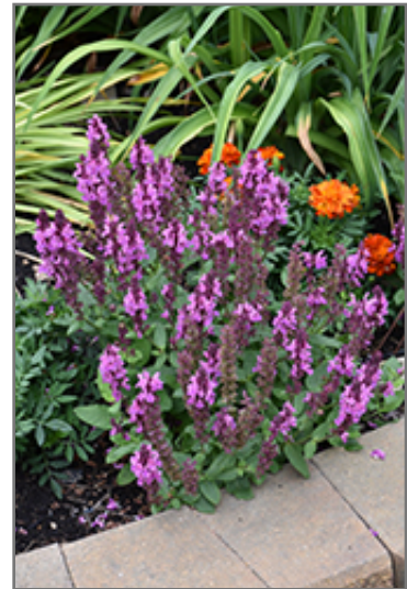
Rose Marvel Meadow Sage in bloom

Rose Marvel Meadow Sage is a fine choice for the garden, but it is also a good selection for planting in outdoor pots and containers. It is often used as a 'filler' in the 'spiller-thriller-filler' container combination, providing a mass of flowers against which the larger thriller plants stand out. Note that when growing plants in outdoor containers and baskets, they may require more frequent waterings than they would in the yard or garden.