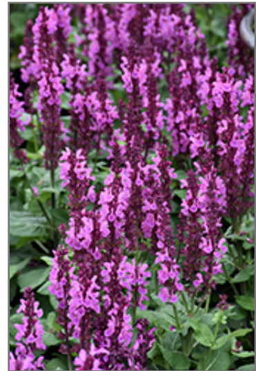
Rose Marvel Meadow Sage flowers

This is a relatively low maintenance plant, and is best cleaned up in early spring before it resumes active growth for the season. It is a good choice for attracting butterflies and hummingbirds to your yard, but is not particularly attractive to deer who tend to leave it alone in favor of tastier treats. It has no significant negative characteristics.