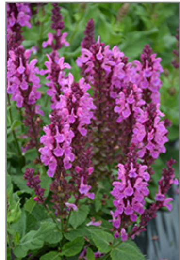
Rose Marvel Meadow Sage flowers