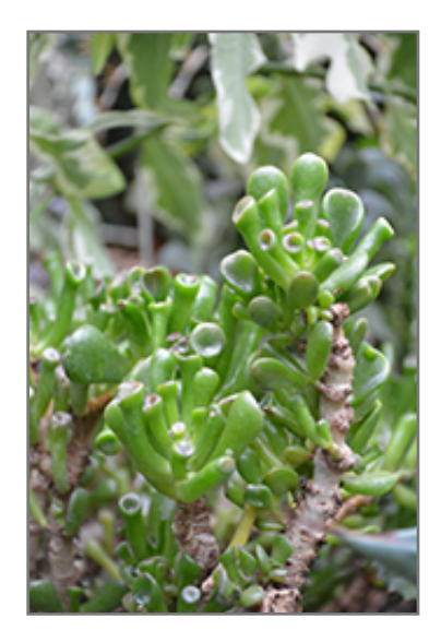
Hobbit Jade Plant foliage

This is a relatively low maintenance shrub, and can be pruned at anytime. It is a good choice for attracting bees and butterflies to your yard, but is not particularly attractive to deer who tend to leave it alone in favor of tastier treats. It has no significant negative characteristics.