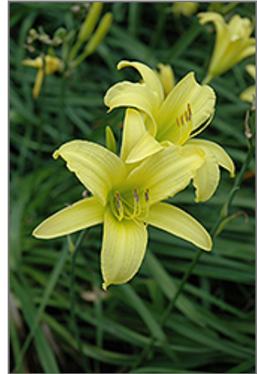
Hyperion Daylily flowers

Masses of small, sweetly scented yellow blooms with chartreuse colored throats rise above green strappy foliage; drought tolerant once established, great for borders, beds and growing en masse; easy to grow with long blooming season