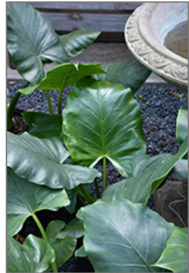
Borneo Giant Elephant's Ear foliage

When grown indoors, Borneo Giant Elephant's Ear can be expected to grow to be about 12 feet tall at maturity, with a spread of 10 feet. It grows at a medium rate, and under ideal conditions can be expected to live for approximately 5 years. This houseplant will do well in a location that gets either direct or indirect sunlight, although it will usually require a more brightly-lit environment than what artificial indoor lighting alone can provide. It is quite adaptable, preferring to grow in average to wet conditions, and will even tolerate some standing water. The surface of the soil should be kept consistently moist all of the time, and you should expect to water this plant two or more times each week, especially if it's growing in a low-humidity environment. Be aware that your particular watering schedule may vary depending on its location in the room, the pot size, plant size and other conditions; if in doubt, ask one of our experts in the store for advice. It is not particular as to soil type or pH; an average potting soil should work just fine. Be warned that parts of this plant are known to be toxic to humans and animals, so special care should be exercised if growing it around children and pets.