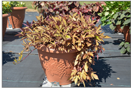
South of the Border Refried Beans Sweet Potato Vine

South of the Border Refried Beans Sweet Potato Vine will grow to be about 8 inches tall at maturity, with a spread of 3 feet. When grown in masses or used as a bedding plant, individual plants should be spaced approximately 12 inches apart. Its foliage tends to remain low and dense right to the ground. This fast-growing annual will normally live for one full growing season, needing replacement the following year.