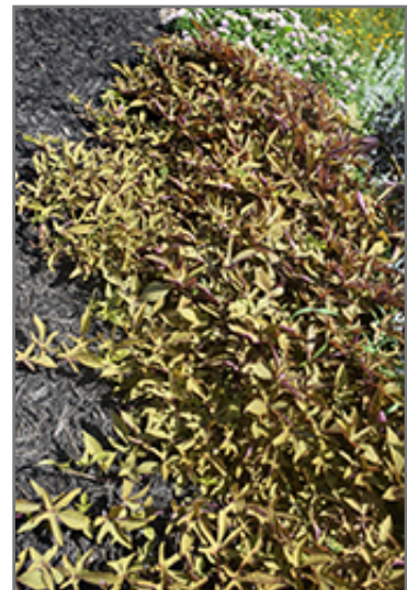
South of the Border Refried Beans Sweet Potato Vine