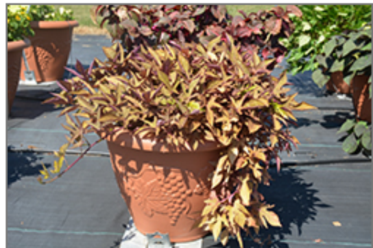
South of the Border Refried Beans Sweet Potato Vine