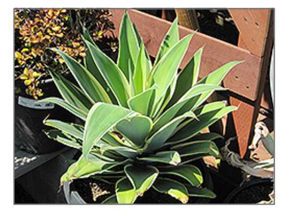
Ray of Light Fox Tail Agave

Plant Height: 5 feet Flower Height: 8 feet Spread: 7 feet Sunlight: O Hardiness Zone: 8b Other Names: Century Plant Description: