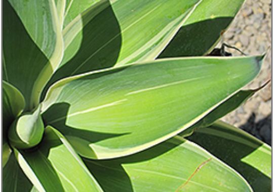
Ray of Light Fox Tail Agave foliage

Thousand Oaks Location 2585 Thousand Oaks San Antonio, TX 78232 (210) 494-6131