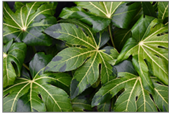
Variegated Japanese Aralia foliage