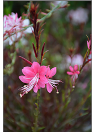
Passionate Rainbow Petite Gaura flowers

Passionate Rainbow Petite Gaura is recommended for the following landscape applications;