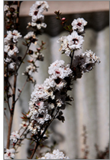
Snow White Tea-Tree flowers