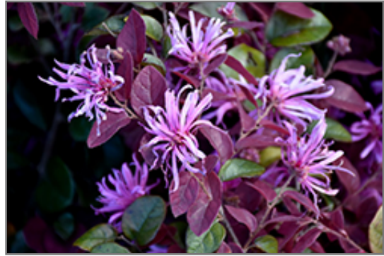
Ruby Chinese Fringeflower flowers

Ruby Chinese Fringeflower will grow to be about 5 feet tall at maturity, with a spread of 5 feet. It has a low canopy, and is suitable for planting under power lines. It grows at a fast rate, and under ideal conditions can be expected to live for 40 years or more.