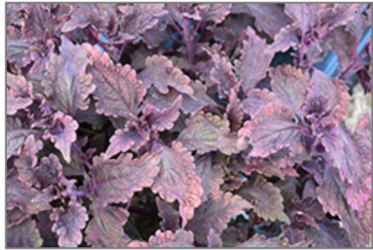
Stained Glassworks Molten Lava Coleus foliage

Stained Glassworks Molten Lava Coleus is recommended for the following landscape applications;