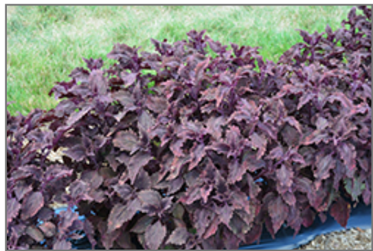
Stained Glassworks Molten Lava Coleus