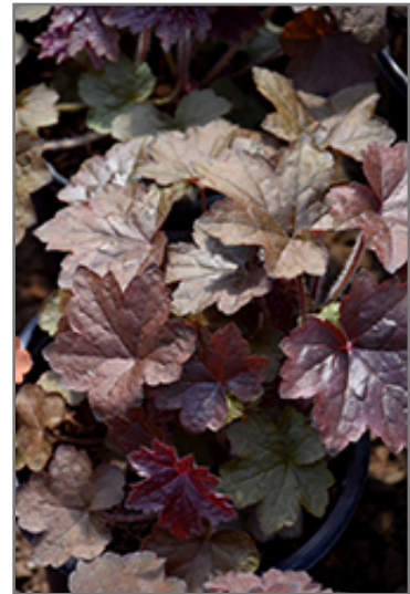
Palace Purple Coral Bells foliage

Palace Purple Coral Bells is recommended for the following landscape applications;