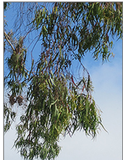
Lemon-scented Gum foliage