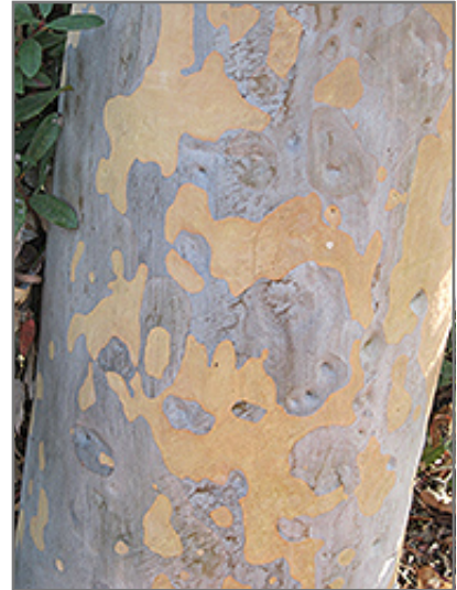
Lemon-scented Gum bark

This tree should only be grown in full sunlight. It prefers dry to average moisture levels with very well-drained soil, and will often die in standing water. It may require supplemental watering during periods of drought or extended heat. It is particular about its soil conditions, with a strong preference for sandy, acidic soils, and is able to handle environmental salt. It is somewhat tolerant of urban pollution. This species is not originally from North America.