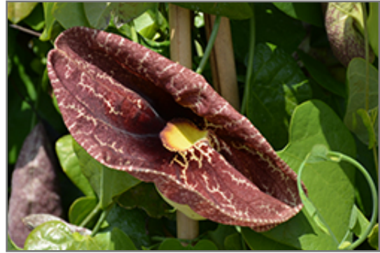
Giant Dutchman's Pipe flowers