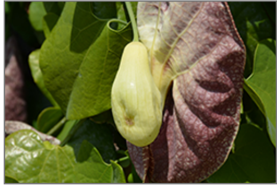
Giant Dutchman's Pipe flowers

This woody vine does best in full sun to partial shade. It prefers to grow in average to moist conditions, and shouldn't be allowed to dry out. It may require supplemental watering during periods of drought or extended heat. It is not particular as to soil type or pH. It is highly tolerant of urban pollution and will even thrive in inner city environments. This species is not originally from North America.