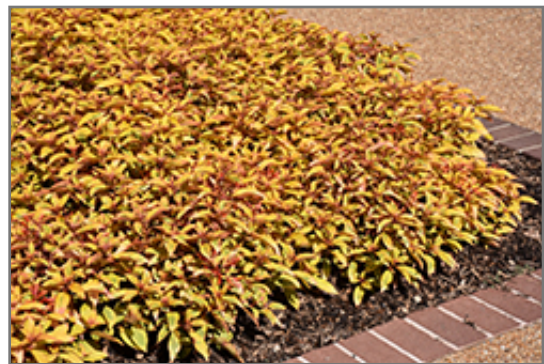
Lime Sizzler Firebush