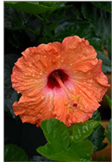
Mandarin Wind Hibiscus flowers

This tropical plant does best in full sun to partial shade. It requires an evenly moist well-drained soil for optimal growth, but will die in standing water. It may require supplemental watering during periods of drought or extended heat. It is not particular as to soil type or pH. It is highly tolerant of urban pollution and will even thrive in inner city environments. Consider applying a thick mulch around the root zone in winter to protect it in exposed locations or colder microclimates. This is a selected variety of a species not originally from North America. It can be propagated by cuttings; however, as a cultivated variety, be aware that it may be subject to certain restrictions or prohibitions on propagation.