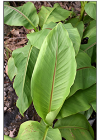
Blood Banana foliage

When grown indoors, Blood Banana can be expected to grow to be about 8 feet tall at maturity, with a spread of 6 feet. It grows at a fast rate, and under ideal conditions can be expected to live for approximately 30 years. This houseplant will do well in a location that gets either direct or indirect sunlight, although it will usually require a more brightly-lit environment than what artificial indoor lighting alone can provide. It does best in average to evenly moist soil, but will not tolerate standing water. The surface of the soil shouldn't be allowed to dry out completely, and so you should expect to water this plant once and possibly even twice each week. Be aware that your particular watering schedule may vary depending on its location in the room, the pot size, plant size and other conditions; if in doubt, ask one of our experts in the store for advice. It is not particular as to soil pH, but grows best in rich soil. Contact the store for specific recommendations on pre-mixed potting soil for this plant.