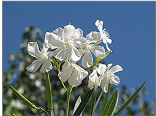
Hardy White Oleander flowers

A popular tropical shrub grown for its bright white flowers in summer; an excellent indoor accent plant for high light areas; pruning required to maintain strong structure; parts of this plant are known to be toxic