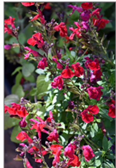
Mirage Cherry Red Autumn Sage flowers