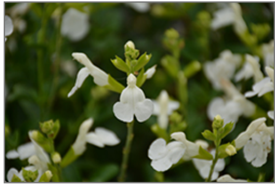
Mirage White Autumn Sage flowers

This is a relatively low maintenance plant, and should only be pruned after flowering to avoid removing any of the current season's flowers. It is a good choice for attracting bees, butterflies and hummingbirds to your yard, but is not particularly attractive to deer who tend to leave it alone in favor of tastier treats. It has no significant negative characteristics.