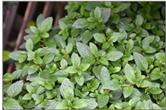
Peppermint foliage

Peppermint features bold spikes of lavender flowers with pink overtones rising above the foliage in mid summer. Its attractive fragrant pointy leaves remain green in color throughout the season.