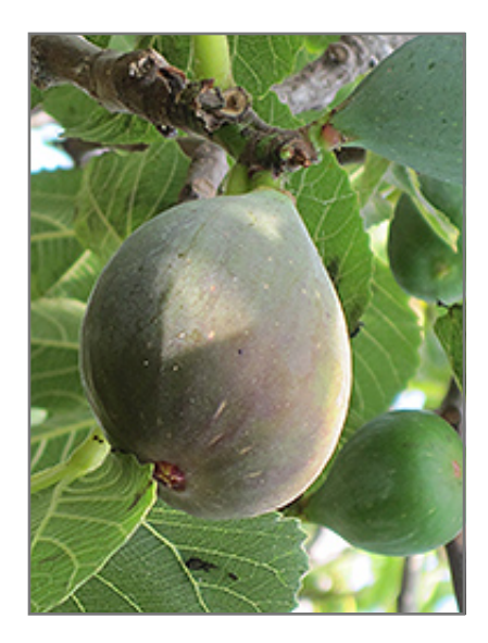
Celeste Fig fruit

Bandera Location 8516 Bandera Road San Antonio, TX 78250 (210) 680-2394