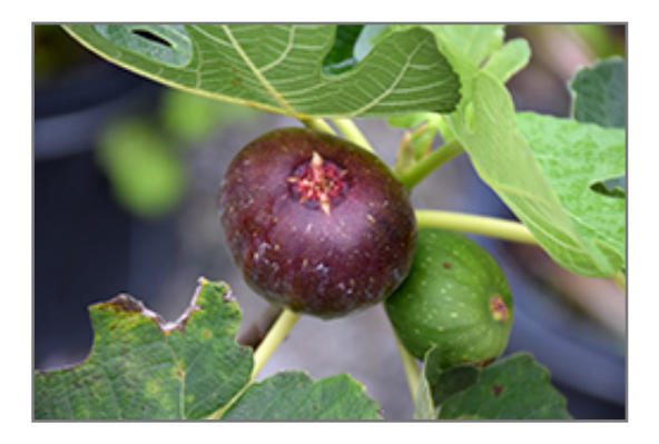
Celeste Fig fruit

Celeste Fig has attractive dark green foliage with chartreuse veins on a tree with a round habit of growth. The lobed leaves are highly ornamental but do not develop any appreciable fall color. The fruits are showy plum purple pomes with a coppery-bronze blush, which are carried in abundance in mid summer. The fruit can be messy if allowed to drop on the lawn or walkways, and may require occasional clean-up.