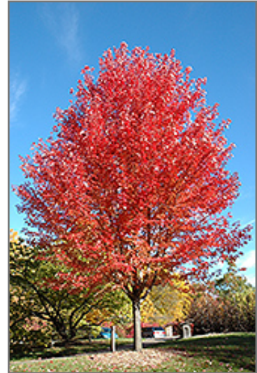
Autumn Blaze Maple in fall