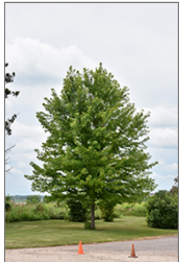
Autumn Blaze Maple