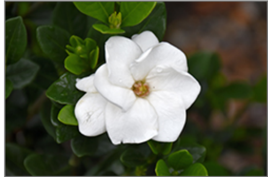
Gardenia flowers

When grown indoors, Gardenia can be expected to grow to be about 8 feet tall at maturity, with a spread of 6 feet. It grows at a slow rate, and under ideal conditions can be expected to live for approximately 30 years. This houseplant will do well in a location that gets either direct or indirect sunlight, although it will usually require a more brightly-lit environment than what artificial indoor lighting alone can provide. It does best in average to evenly moist soil, but will not tolerate standing water. The surface of the soil shouldn't be allowed to dry out completely, and so you should expect to water this plant once and possibly even twice each week. Be aware that your particular watering schedule may vary depending on its location in the room, the pot size, plant size and other conditions; if in doubt, ask one of our experts in the store for advice. It is very fussy about its soil conditions and must be grown in rich, acidic soil to ensure success. Contact the store for specific recommendations on pre-mixed potting soil for this plant.