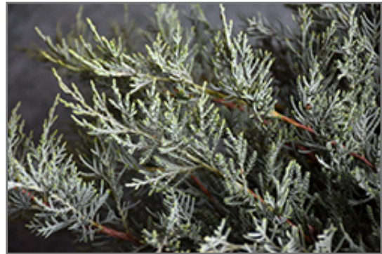
Grey Guardian Redcedar flowers

An excellent low spreading shrub, producing beautiful greyish-blue, fine-textured foliage on a low, spreading habit of growth; very adaptable but needs full sun