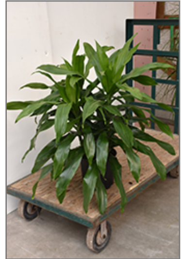
Janet Craig Dracaena

There are many factors that will affect the ultimate height, spread and overall performance of a plant when grown indoors; among them, the size of the pot it's growing in, the amount of light it receives, watering frequency, the pruning regimen and repotting schedule. Use the information described here as a guideline only; individual performance can and will vary. Please contact the store to speak with one of our experts if you are interested in further details concerning recommendations on pot size, watering, pruning, repotting, etc.