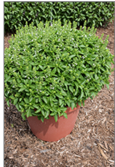
Greek Basil