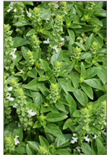
Greek Basil foliage

Greek Basil will grow to be about 10 inches tall at maturity, with a spread of 12 inches. When grown in masses or used as a bedding plant, individual plants should be spaced approximately 10 inches apart. This fast-growing annual will normally live for one full growing season, needing replacement the following year.